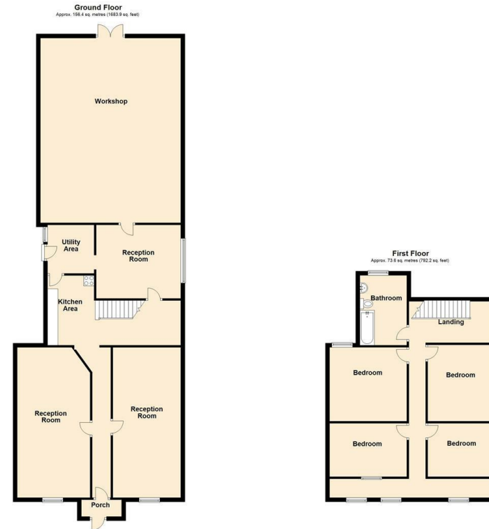
Total area: approx. 230.0 sq. metres (2476.1 sq. feet)