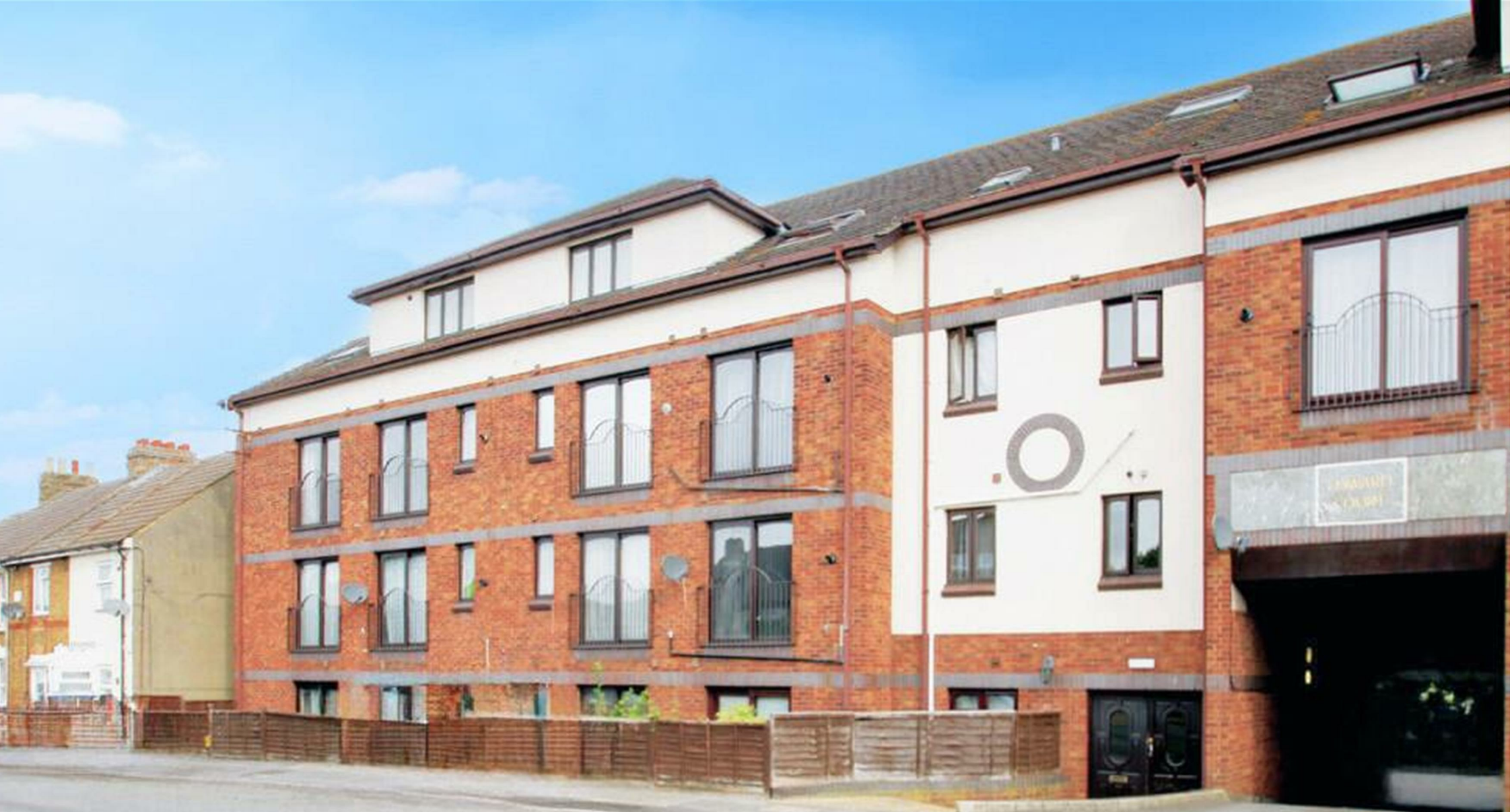
Capstone Road Chatham | ME5 7TY