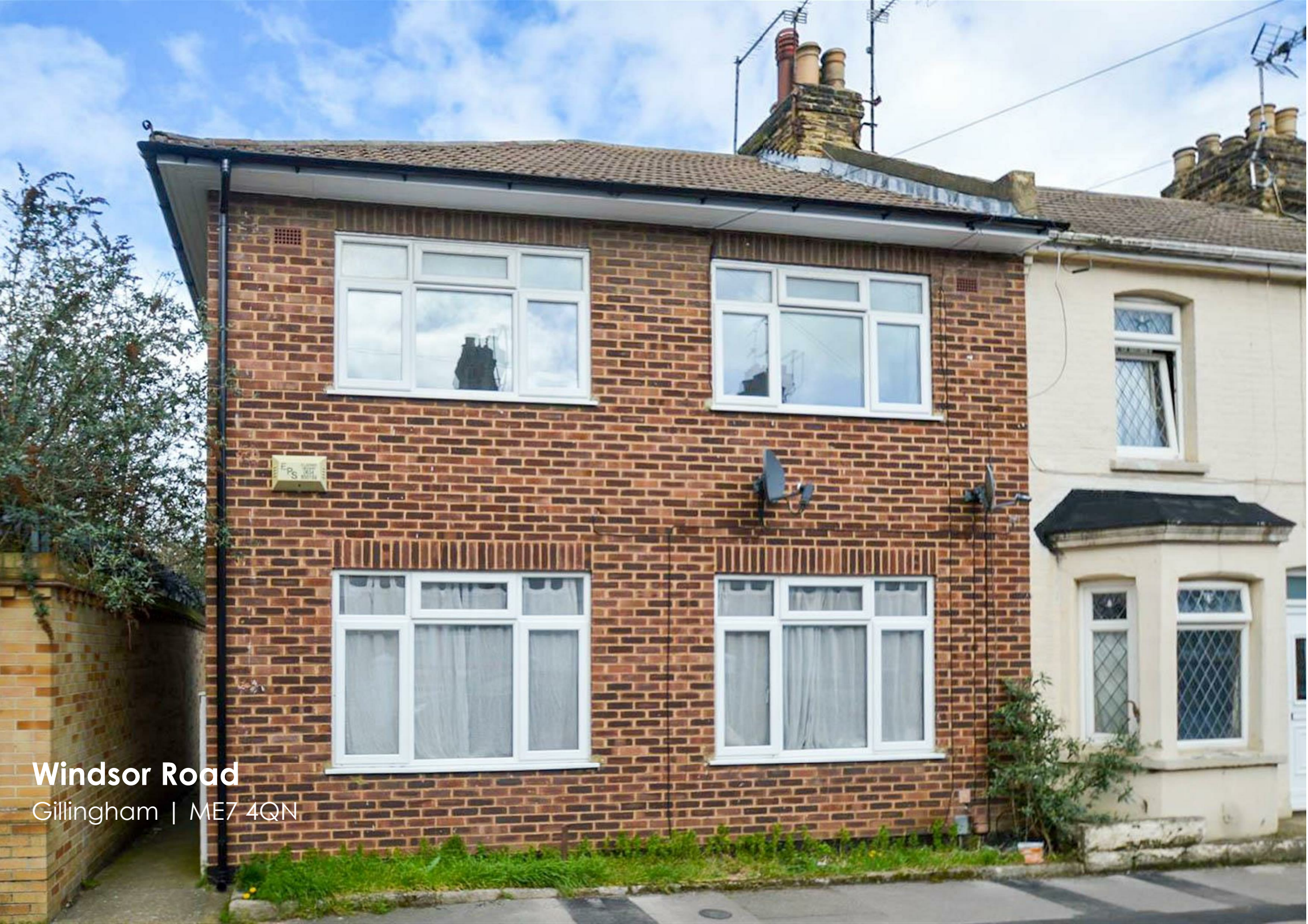
Windsor Road Gillingham | ME7 4QN