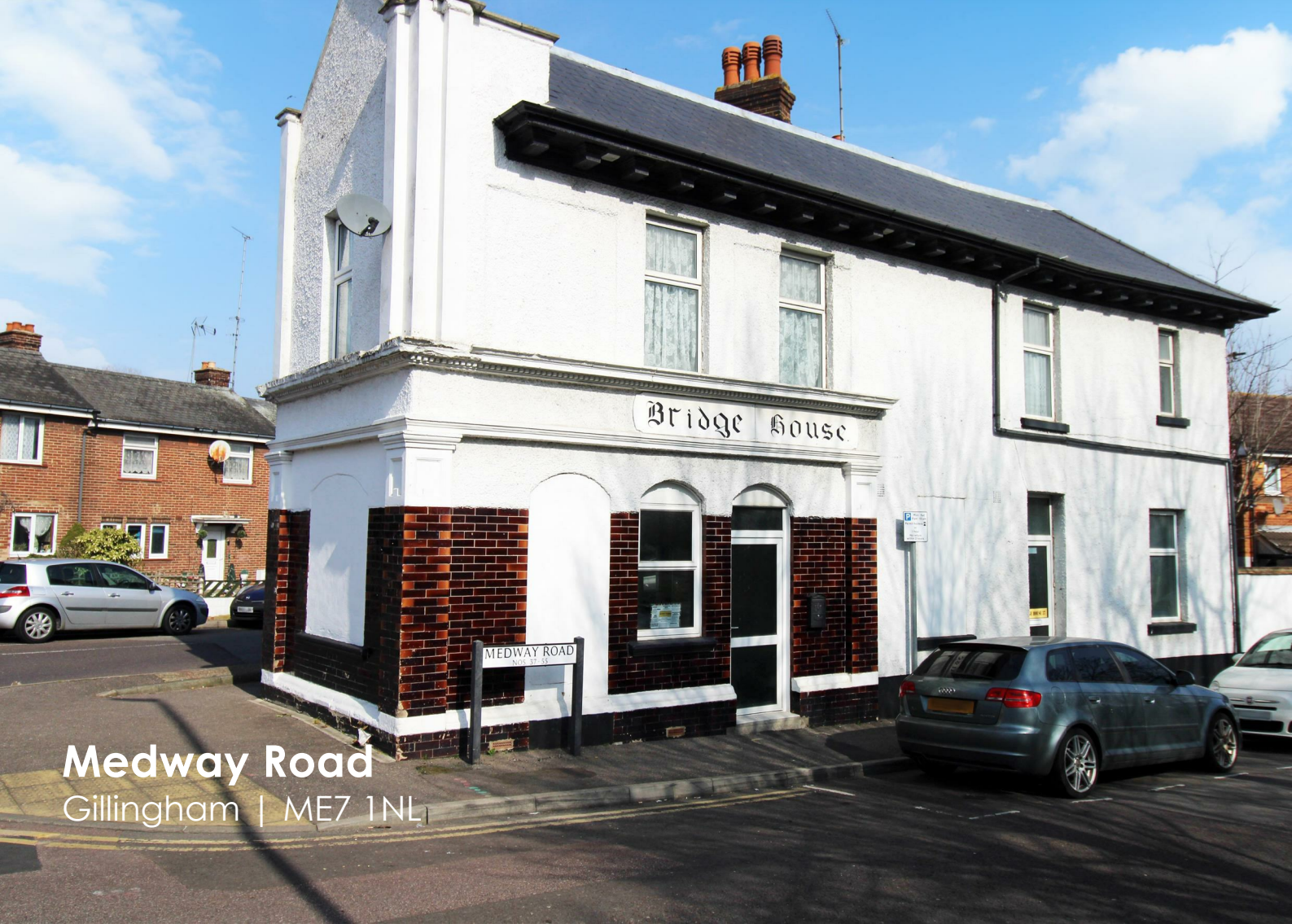
Medway Road Gillingham | ME7 1NL